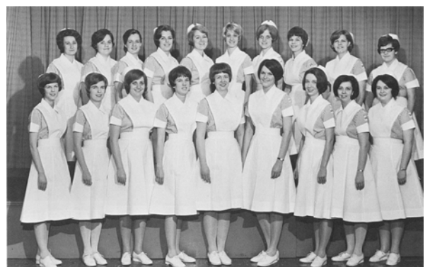
Members of the Nurse’s Choir